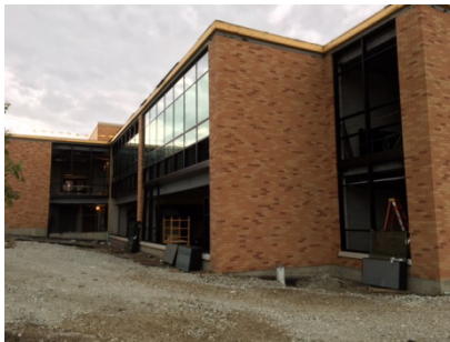
Sprague – Exterior, North side