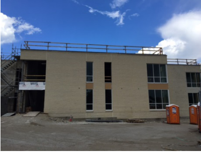
Half Day – Exterior Facebrick, Windows