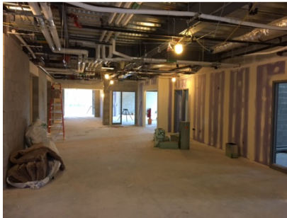
Half Day – Interior