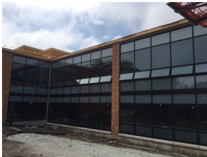
Sprague – Exterior at North