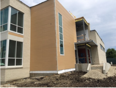
Half Day – Exterior, South Ramp