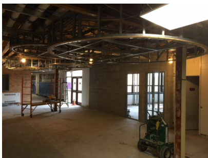
Sprague – Interior/Renovation Space