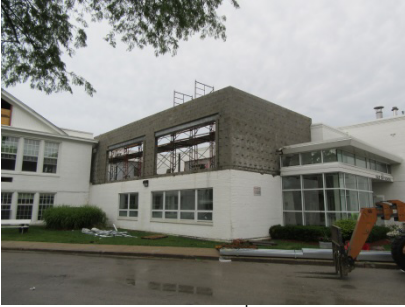
Half Day – Exterior, 2 nd Floor Addition