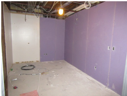
Sprague – Existing School Renovation