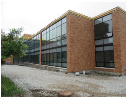
Sprague – Addition, Exterior