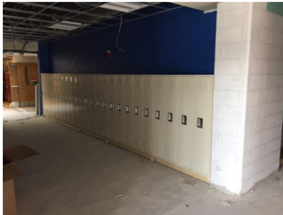
Half Day – Lockers in progress