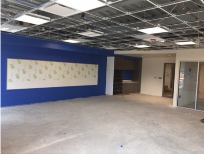
Half Day – Classroom