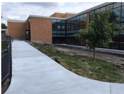
Sprague – Sidewalks