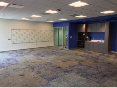
Half Day – Classroom