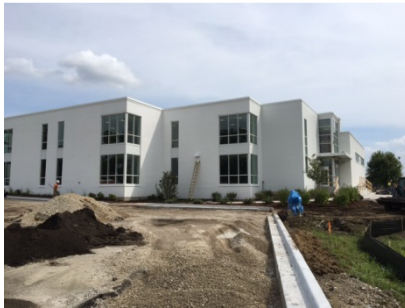
Half Day – Landscaping